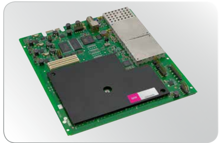
Quad QAM backend module - FTA